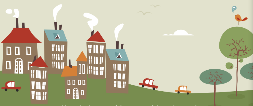
Elder Richard G. Scott of the Quorum of the Twelve Apostles, “For Peace at Home,” April 2013 general conference

“ONE OF THE GREATEST BLESSINGS WE CAN OFFER TO THE WORLD IS THE POWER OF A CHRIST-CENTERED HOME WHERE THE GOSPEL IS TAUGHT, COVENANTS ARE KEPT, AND LOVE ABOUNDS.”