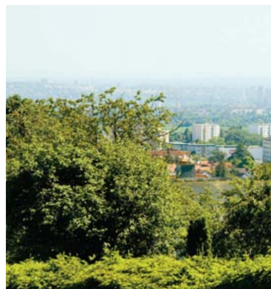
A view from Friedrichsdorf, Germany, near Frankfurt.