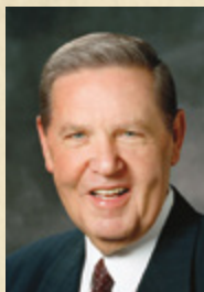
By Elder Jeffrey R. Holland Of the Quorum of the Twelve Apostles