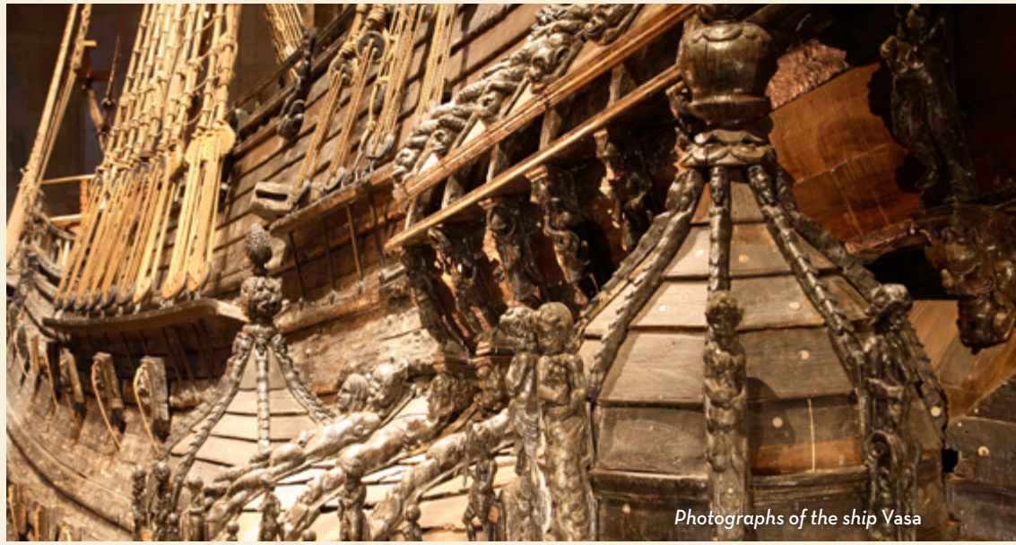
Photographs of the ship Vasa

sustain as prophets, seers, and revelators; by parents; and by trusted friends—or not. We can seek to be lifelong learners—or not. We can increase our spiritual stability—or not. If we fail to increase our spiritual stability, we will become like the Vasa —a boat that won't float.