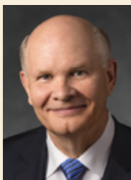
By Elder Dale G. Renlund Of the Quorum of the Twelve Apostles