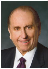
By President Thomas S. Monson