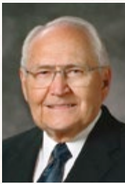
By Elder L. Tom Perry

In addition to giving me the formal interview, Dad, who was my bishop, wanted to make it a learning experience for me.