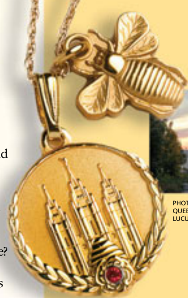
PHOTOGRAPH OF MONTREAL QUEBEC TEMPLE