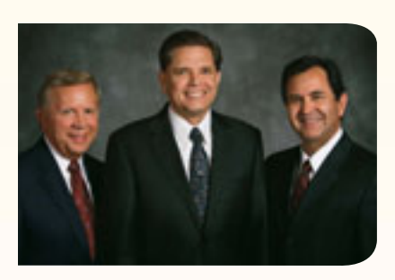
By the Young Men General Presidency