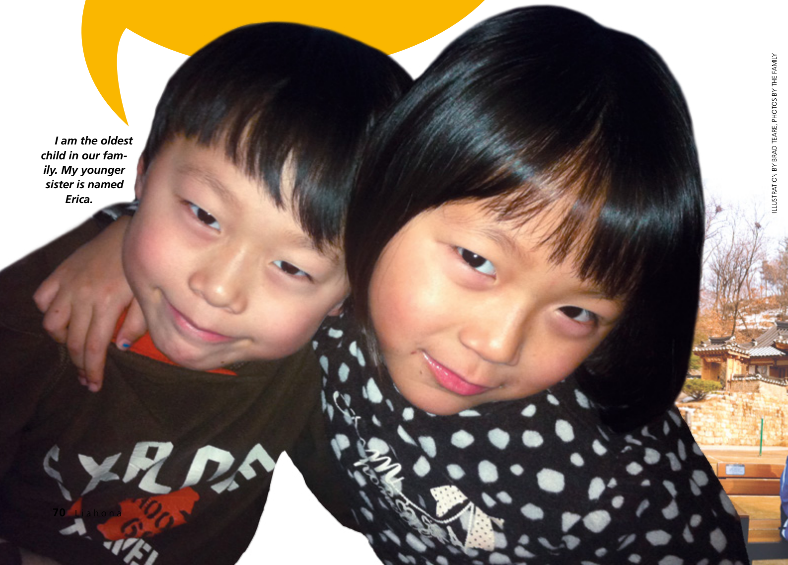
ILLUSTRATION BY BRAD TEARE

I am the oldest child in our fam- ily. My younger sister is named Erica.