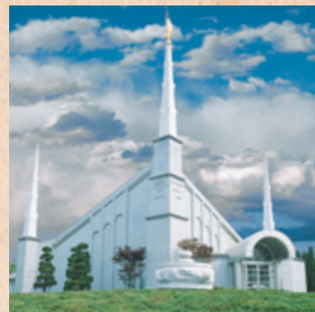
I LOVE TO SEE THE TEMPLE!