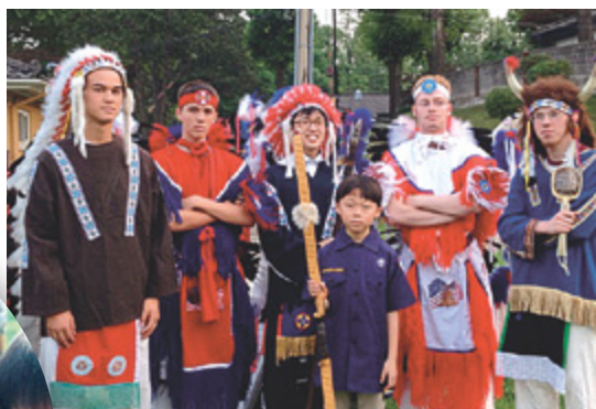
I am a citizen of both the United States and South Korea, so I take part in the Boy Scouts of America program at church.