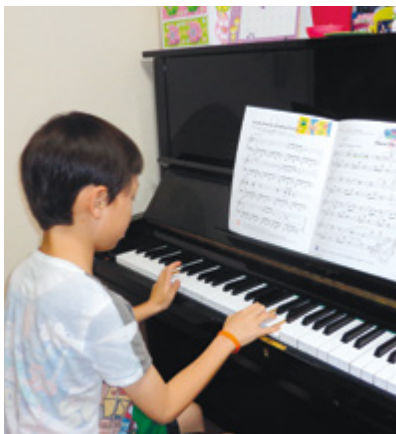
I go to school from 8:30 a.m. until 2:30 p.m. Then I go to an after-school academy called a hak-won for extra studies. I also take piano and art lessons.