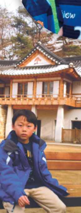
Chuseok is one of our biggest holidays. It is a celebration of the harvest—a Korean Thanksgiving.