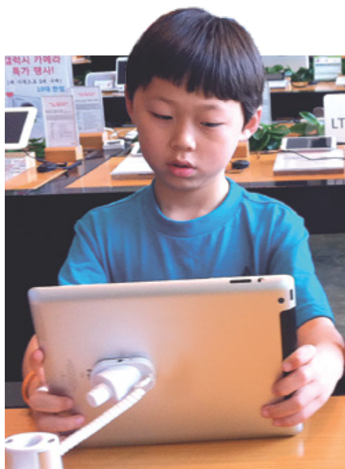
I like to read. I am bilingual, which means I can read, write, and speak in both Korean and English.