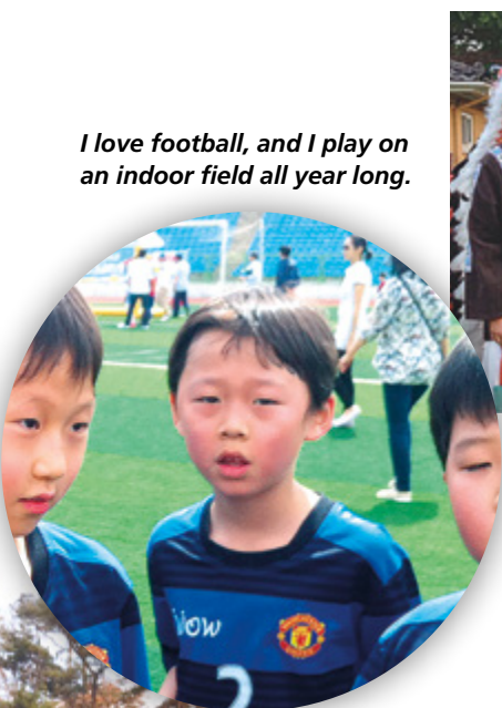
I love football, and I play on an indoor field all year long.