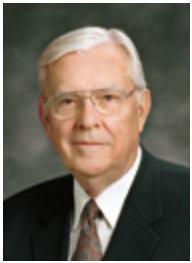
By Elder M. Russell Ballard Of the Quorum of the Twelve Apostles