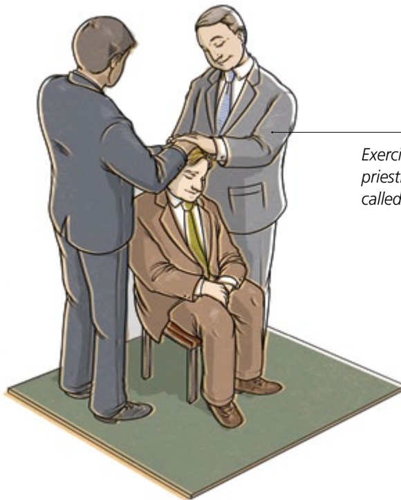
Exercise the priesthood when called upon.