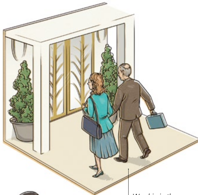
Worship in the temple.

Priesthood holders gain power in the priesthood through faith and obedience: