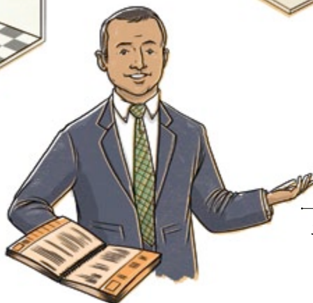
Serve faithfully in your calling.