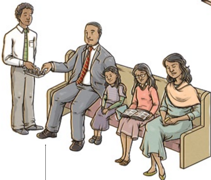
Take the sacrament worthily.