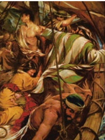
Above: Nephi endured being bound for four days until Laman and Lemuel repented and loosed him (see 1 Nephi 18:9–21). Right: None of the 2,000 young men in Helaman's army were killed in battle (see Alma 56:44–57).

Principles from the Book of Mormon help us live with faith and hope during troubled times.