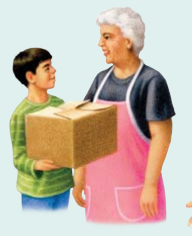
Love God and all people.