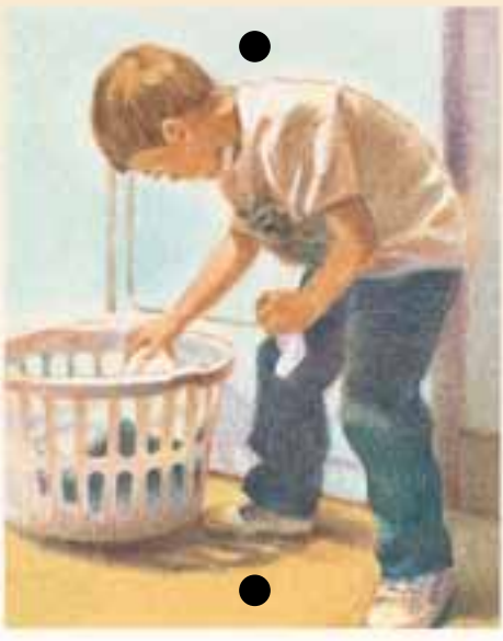
Note: If you do not wish to remove pages from the magazine, this activity may be copied or printed from www.lds.org. For English, click on "Gospel Library." For other languages, click on "Languages."