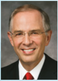
By Elder Neil L. Andersen