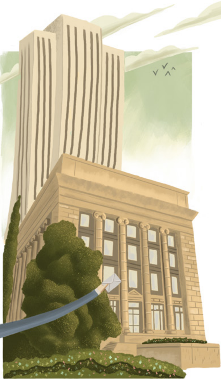
At Church headquarters, the First Presidency, Quorum of the Twelve Apostles, and Presiding Bishopric are the Council on the Disposition of the Tithes (see D&C 120). As directed by the Lord, they make inspired decisions on how these sacred tithing funds will be used.