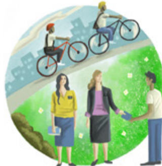
Doing missionary work