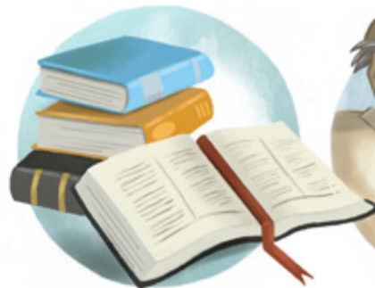
Printing scriptures and other materials