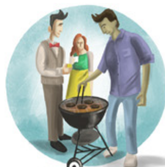
Providing Church activities for fellowship among ward or branch members