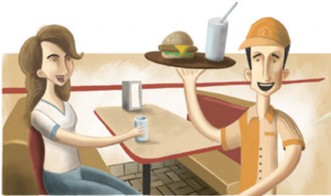
You earn money.

What happens to the money you pay for tithing?