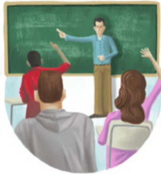
Operating Church-education programs