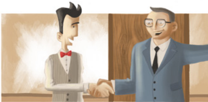
You give your tithing to a member of your bishopric or branch presidency or submit it online at donations.lds.org .