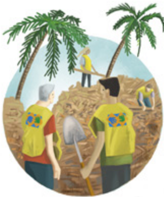
Providing welfare and humanitarian efforts