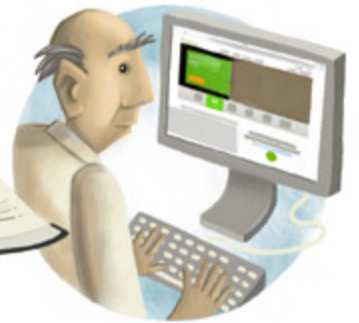
Doing family history research