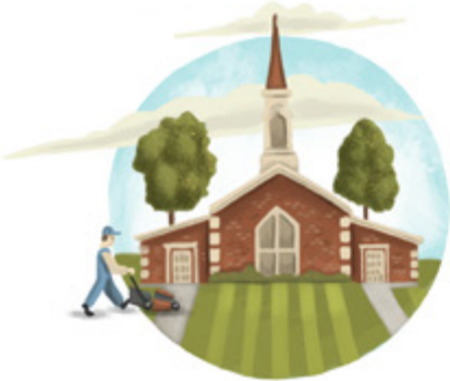
Constructing and maintaining temples, churches, and other Church-owned buildings