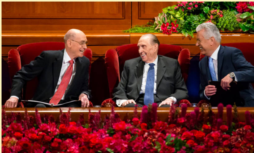
For years, we have studied the Teachings of Presidents of the Church series. In 2018, we will begin using general conference messages to focus our study on the teachings of living prophets, apostles, and other Church leaders.

Instructions for these meetings will be found in the November issue of the Liahona and Ensign , in the Gospel Library app, and at ComeFollowMe.lds.org .