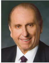
By President Thomas S. Monson