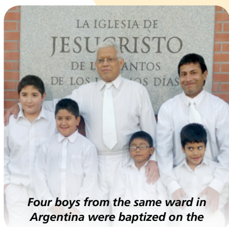
Four boys from the same ward in Argentina were baptized on the same day. Their bishop (center) stands with them.