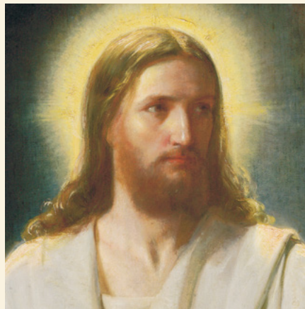
Jesus Christ was the Father's beloved, chosen, and foreordained Son from the beginning.

God created Adam and Eve and joined them as husband and wife, placed them in the Garden of Eden, and commanded them to have children. 26 Exercising their agency,