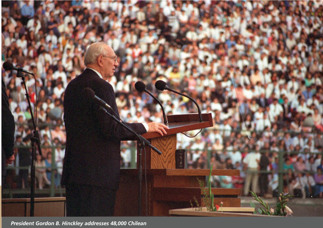
Latter-day Saints in 1996 at a conference in Santiago.

of the Seventy, was one of the first seminary teachers and later worked for the Church Educational System in Chile. He said, "The Lord chose the young people who were there at that time and many of them are returned missionaries and great leaders with good families. . . . For me, seminary and institute was a means of salvation during times of so much strife in our country and I'm grateful I was called to work with the education system."<sup>6</sup>