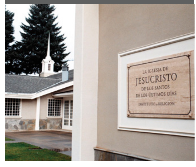
The institute of religion in Temuco is one of 50 such institutes in Chile.

In March 1964, the first two Church-run primary schools were founded in Chile. Ultimately several schools were opened, and enrollment reached more than 2,600 students. By the late 1970s and early 1980s, adequate public schools became more widely available, and the Church announced closure of the schools in Chile.