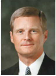
By Elder David A. Bednar Of the Quorum of the Twelve Apostles