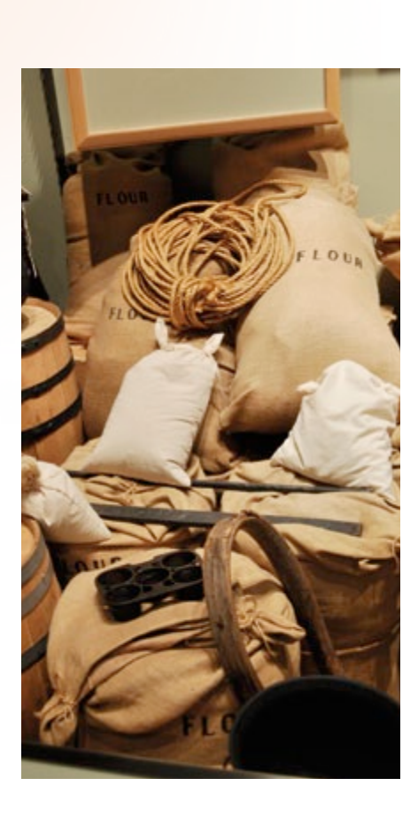
At the Mormon Trail Center, you can see the kinds of supplies the Saints took on their journey west. Church leaders told them to take flour, spices, rice, beans, and milk cows.

Today you can see the beautiful Winter Quarters Nebraska Temple and visit the Mormon Trail Center in Winter Quarters to learn more about the pioneers. ■