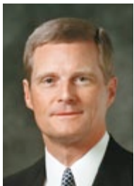
By Elder David A. Bednar Of the Quorum of the Twelve Apostles

You can do this! The Lord you represent and serve knows you can do this. I know you can do this.