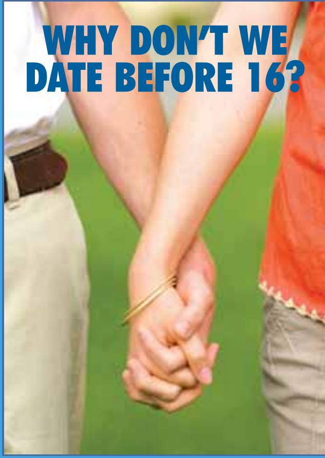
PHOTO ILLUSTRATION BY CHRISTINA SMITH © 2008 INTELLECTUAL RESERVE, INC.