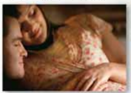
ON THE COVER

14 Abortion: An Assault on the Defenseless