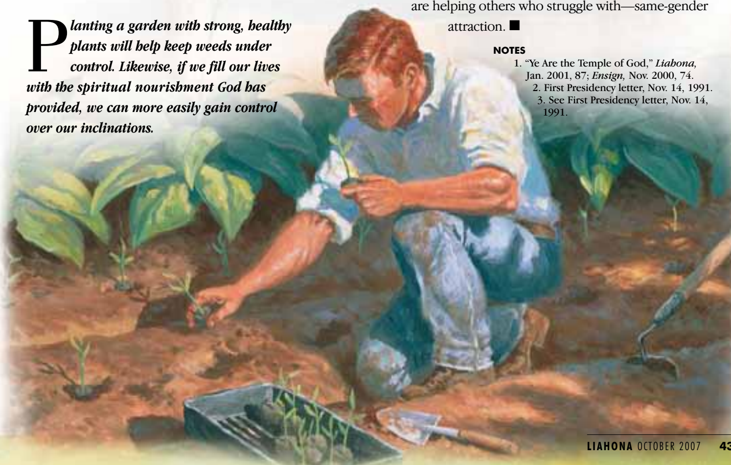
ILLUSTRATION BY CLARK KELLEY PRICE