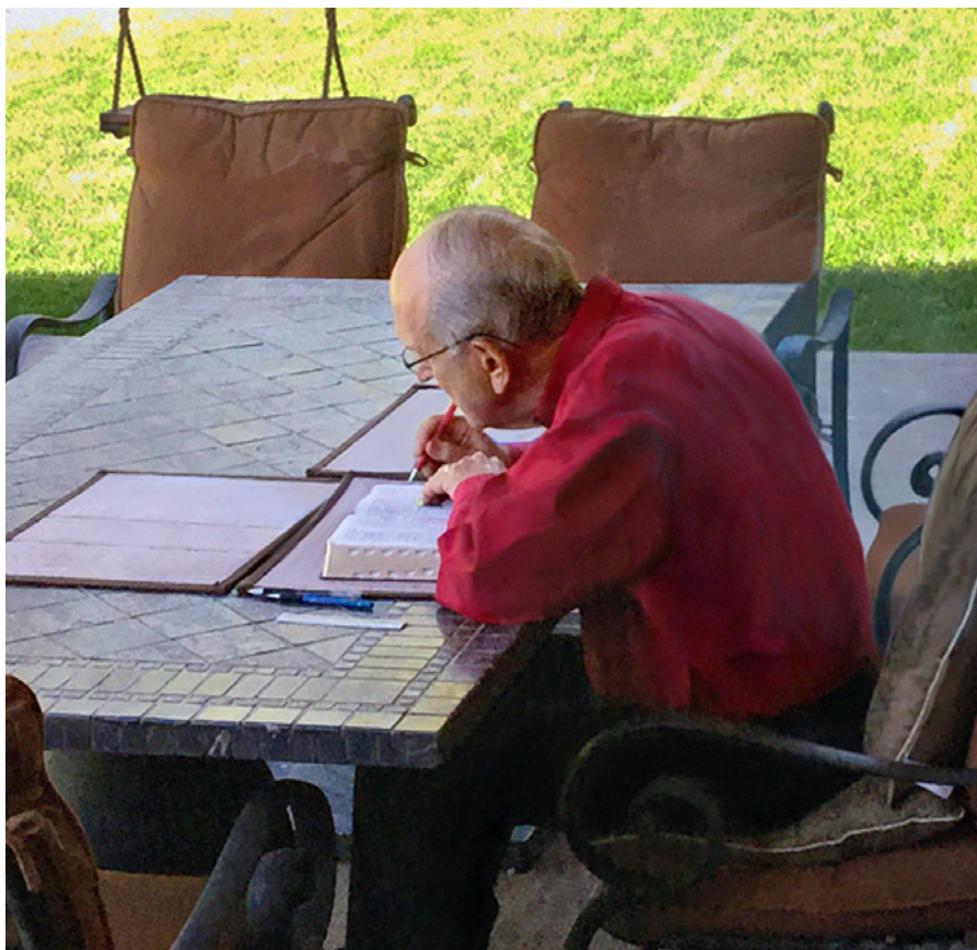
President Nelson is following President Thomas S. Monson’s counsel from the April 2017 general conference to study and ponder the Book of Mormon each day.

is reading his Book of Mormon with the help of an “I Am a Child of God” bookmark.