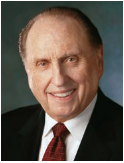
By President Thomas S. Monson