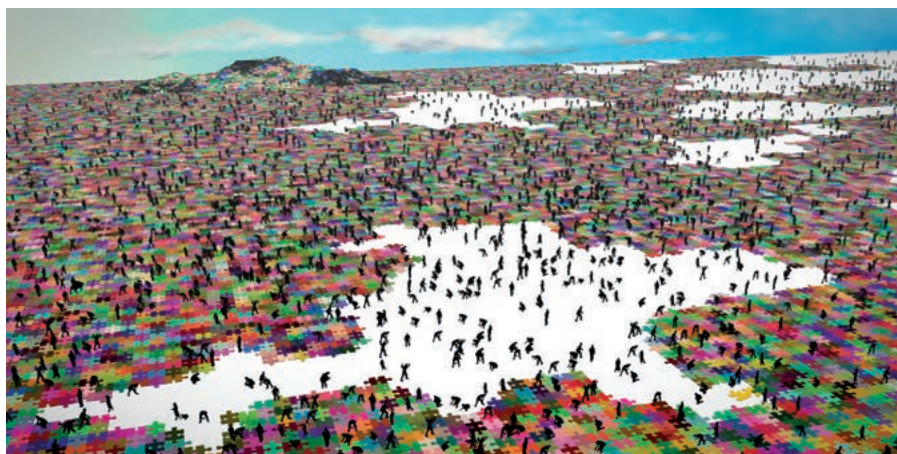
The gathering of Israel is like an enormous puzzle whose pieces will be set in place prior to the Second Coming. Each of us is a piece of the puzzle, and each of us helps to set in place other essential pieces.