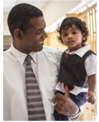
Pictured clockwise from top left are Church members and missionaries in Drammen, Norway; Arica, Chile; Belize City, Belize; Athens, Georgia, USA; Cavite City, Cavite, Philippines; Orange County, California, USA; Kyiv, Ukraine; and Bermejillo, Durango, Mexico.