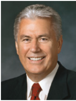
By President Dieter F. Uchtdorf Second Counselor in the First Presidency