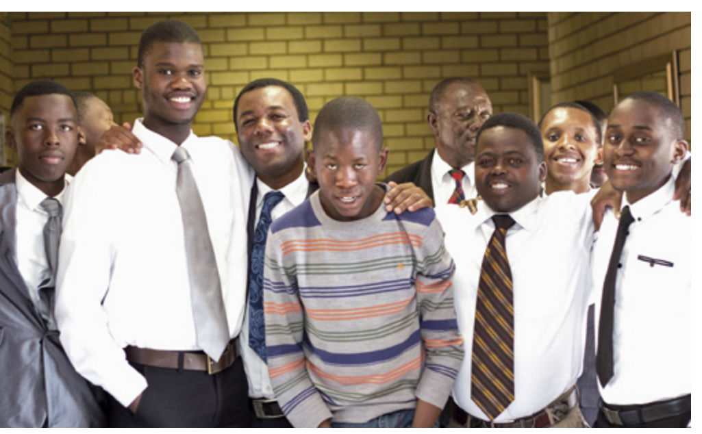
Cape Town, South Africa

place," he said, "that a seed may be planted in your heart, behold, if it be a true seed, or a good seed, if ye do not cast it out by your unbelief, . . . it will begin to swell within your breasts; and when you feel these swelling motions, ye will begin to say within yourselves—It must needs be that this is a good seed, or that the word is good, for it beginneth to enlarge my soul; yea, it beginneth to enlighten my understanding, yea, it beginneth to be delicious to me." 12