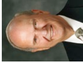
Russell M. Nelson