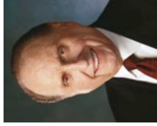
Thomas S. Monson President