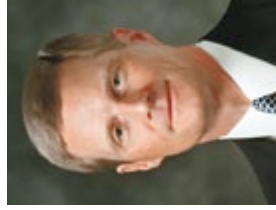
David A. Bednar