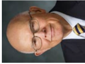
Dallin H. Oaks