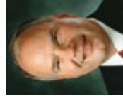
Ronald A. Rasband