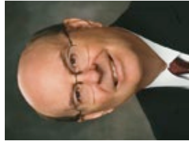
Quentin L. Cook