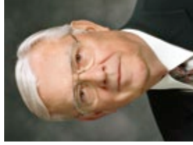
M. Russell Ballard