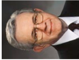
Boyd K. Packer