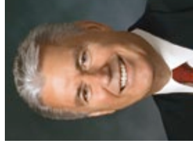
Dieter F. Uchtdorf Second Counselor