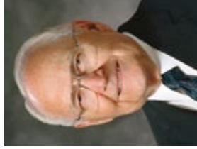
L. Tom Perry