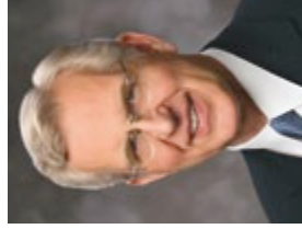
D. Todd Christofferson