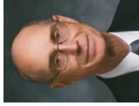
Henry B. Eyring First Counselor