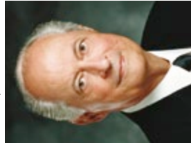
Robert D. Hales