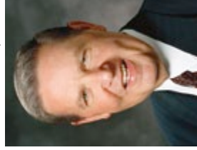
Jeffrey R. Holland