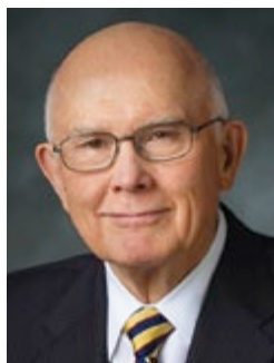
By Elder Dallin H. Oaks Of the Quorum of the Twelve Apostles

Scan this QR code or visit lds.org/go/Oct13Conf13 to share a designed quotation or short video from this message.