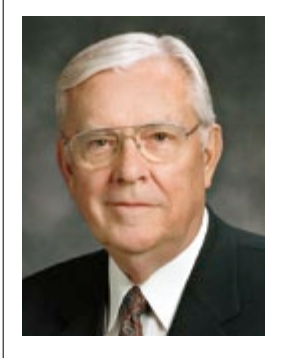
By Elder M. Russell Ballard Of the Quorum of the Twelve Apostles