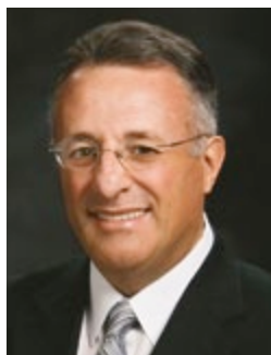
By Elder Ulisses Soares Of the Presidency of the Seventy