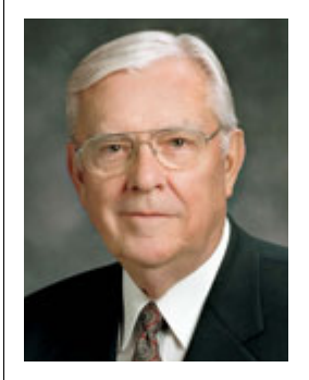
By Elder M. Russell Ballard Of the Quorum of the Twelve Apostles