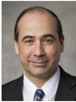
By Elder Valeri V. Cordón Of the Seventy