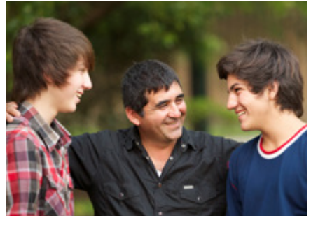
The Lord expects fathers to help shape their children, and children want and need a model.