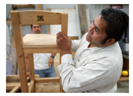
Fatherhood requires sacrifice, but it is a source of incomparable satisfaction.

His work and glory are the development, happiness, and eternal life of His children. Fathers in this fallen world can claim nothing comparable to the Majesty on High, but at their best, they are striving to emulate Him, and they indeed labor in His work. They are honored with a remarkable and sobering trust.