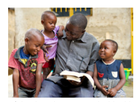
A father who reads scripture to and with his children acquaints them with the voice of the Lord.

Regrettably, due to death, abandonment, or divorce, some children don't have fathers living with them. Some may have fathers who are physically present but emotionally absent or in other ways inattentive or nonsupportive. We call on all fathers to do better and to be better. We call on media and entertainment outlets to portray devoted and capable fathers who truly