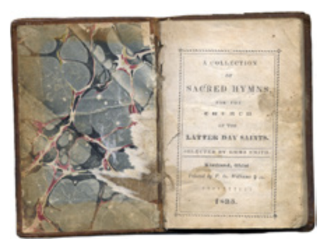
The first edition of the Latter-day Saint hymnal, completed in 1836.

Emma Smith assembled a collection of hymns which first appeared in