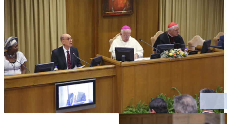
Colloquium on marriage and family, Vatican City

lasting love, going against the common pattern"; this must be done.<sup>2</sup>