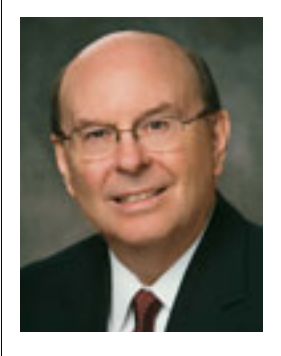
By Elder Quentin L. Cook Of the Quorum of the Twelve Apostles