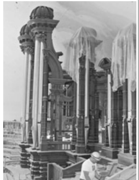
New gold leafing was applied to visible organ pipes.