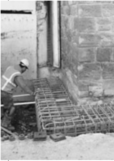
Seismic upgrades included a reinforced foundation.

Tabernacle was officially dedicated in October 1875, after the completion of the interior.