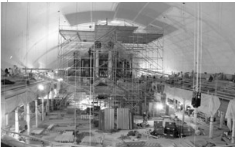
Renovation of the Tabernacle's interior included repairs to the ceiling, new seating, and the creation of an interchangeable rostrum and stage area.

Four years after construction began, conference was held in the Tabernacle. The