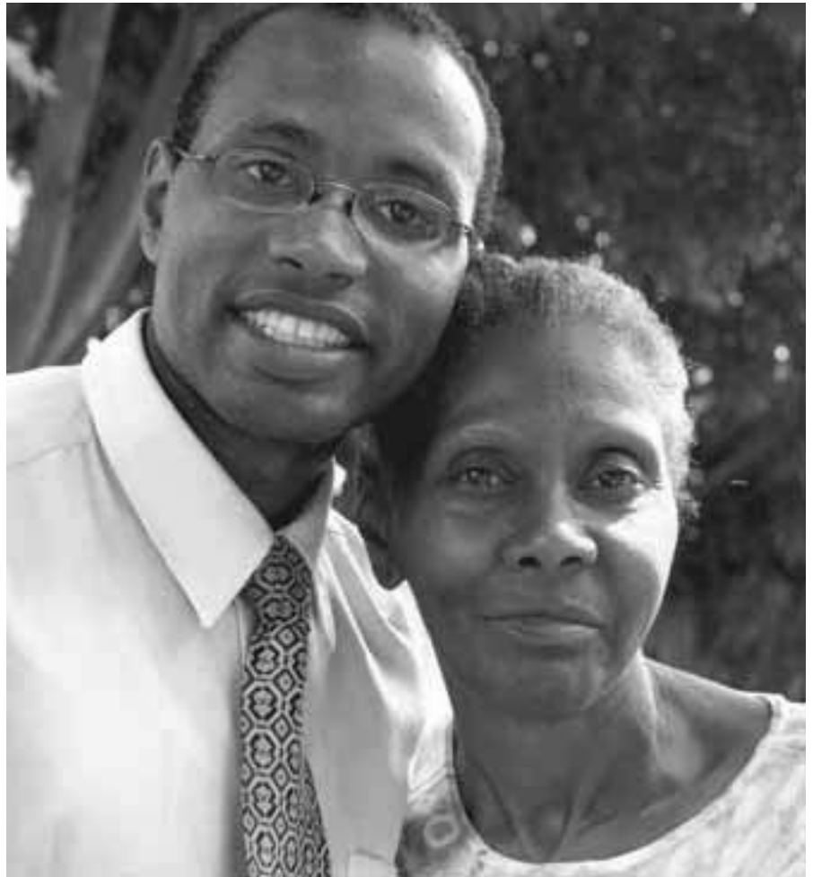
Two members in São Paulo, Brazil, attend a general conference broadcast.

President Hinckley, like Brigham Young, loves the youth and all members of the Church. The youth of the