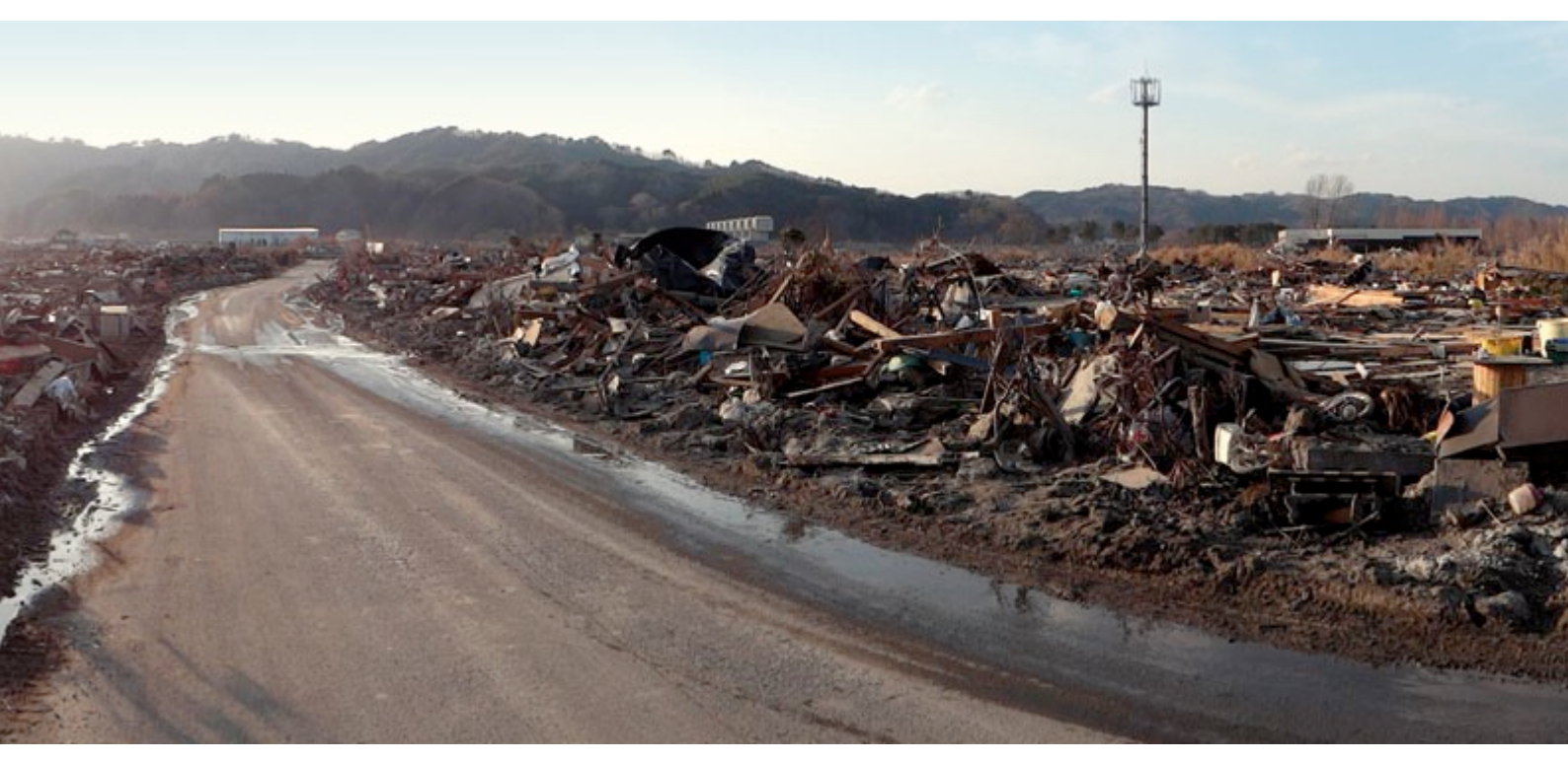
The March 2011 earthquake and resulting tsunami devastated numerous cities in northern Japan (such as Miyako City, above), killing thousands of people and displacing hundreds of thousands others.

The missionaries staggered along the shifting, rocking, heaving floor toward the open door; then they headed down the stairwell and out of the church. Once outside, we felt safer, although we were not yet safe from the elements. The weather had turned bitter cold, and snow pelted our faces.