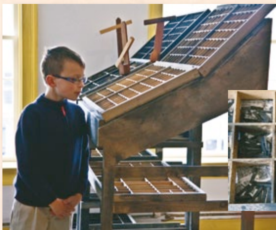
These cases hold thousands of small metal letters called type. Capital letters are called "upper case" because they were kept in the top cases.