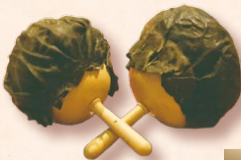
Ink balls were used to put ink onto the type.