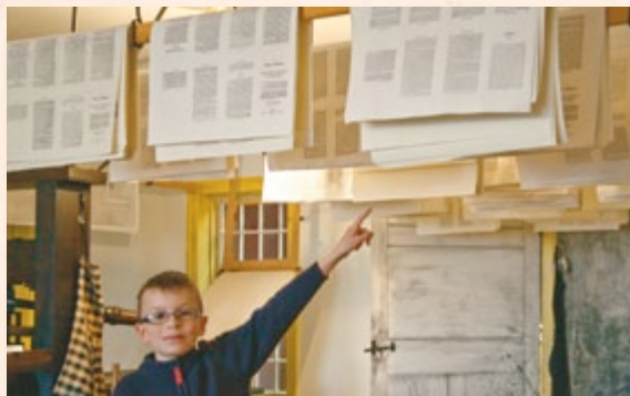
The large pages, called signatures, went to the bindery. Here they were folded, cut into small pages, and stitched together.

The Book of Mormon first went on sale on March 26, 1830. Each copy cost U.S.$1.75. (This is equal to about U.S.$24 today.) Most people had to work about two days to earn that much money.