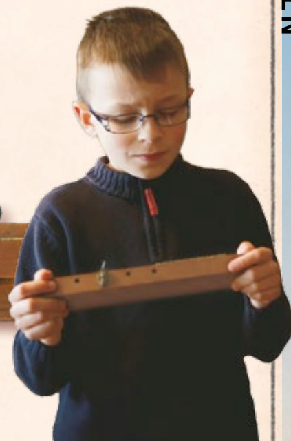
The typesetter had to place one letter at a time into an instrument called a composing stick.