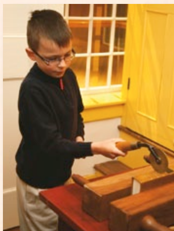
Joseph Smith wanted the Book of Mormon to be a fine leather-covered book stamped with gold letters, like the Bible.

Today thousands of copies of the Book of Mormon are published each year in 85 different languages. Parts of the book are also translated in 23 more languages.