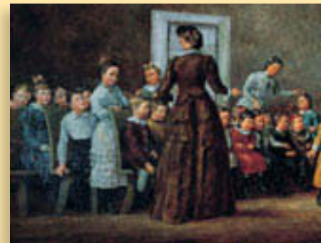
PHOTOGRAPHS BY WEIDEN C. ANDERSEN, EXCEPT AS NOTED; PHOTOGRAPH OF EXTERIOR OF RELIEF SOCIETY BUILDING BY JOHN LUKE; PHOTOGRAPH OF BANDIC BY CRAIG DIMOND; PORTRAIT OF PRIMARY GENERAL PRESIDENCY © BUSATH.COM; ILLUSTRATIONS OF MAP AND ICONS BY DILEEN MARSH; THE FIRST MEETING OF THE PRIMARY ASSOCIATION BY LYNN FAUSSETT AND GORDON COPE. © IRI