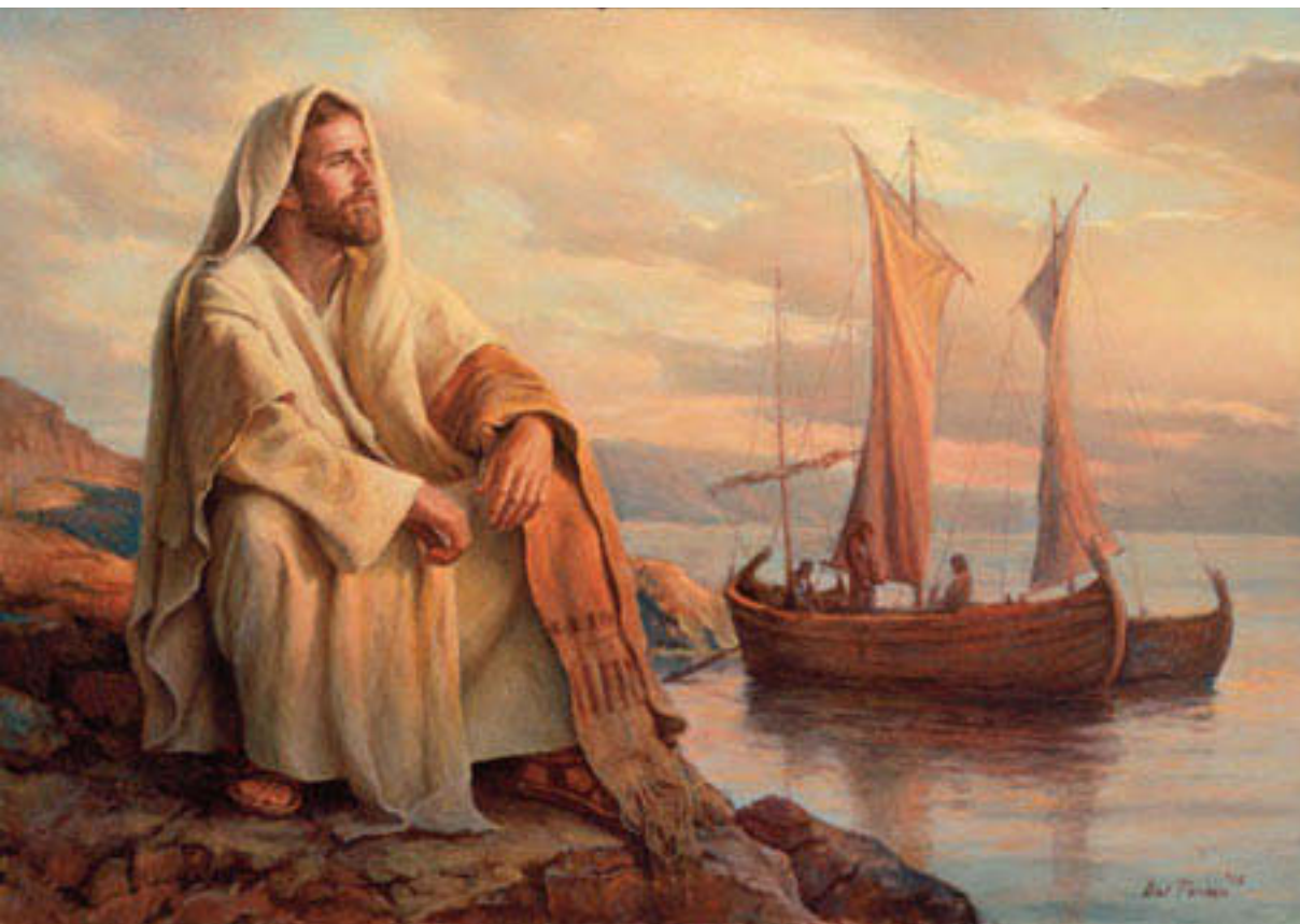
Above: Facing Eternity , by Del Parson, USA "As the day comes to an end, the Savior contemplates His Father's plan. The masts of the fishing boats represent the crosses that wait for Him in the last scene of His earthly life."