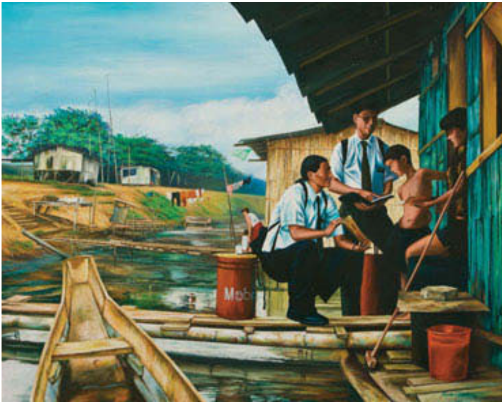
Below: Throughout this article, you will see small details of a sampling of images from the art competition. To see all of the images, visit ArtExhibit.lds.org .