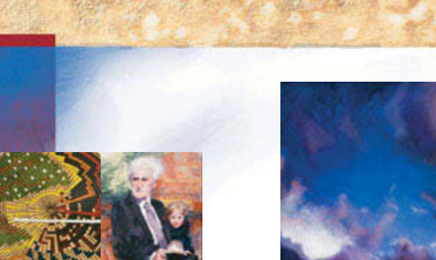
Right: A Stop along the Way , by Carmelo Juan Cuyutupa Caares, Peru "The pioneers felt small joys during their crossing that led them to pause for a moment, notwithstanding the fatigue they felt, and stop along the way."