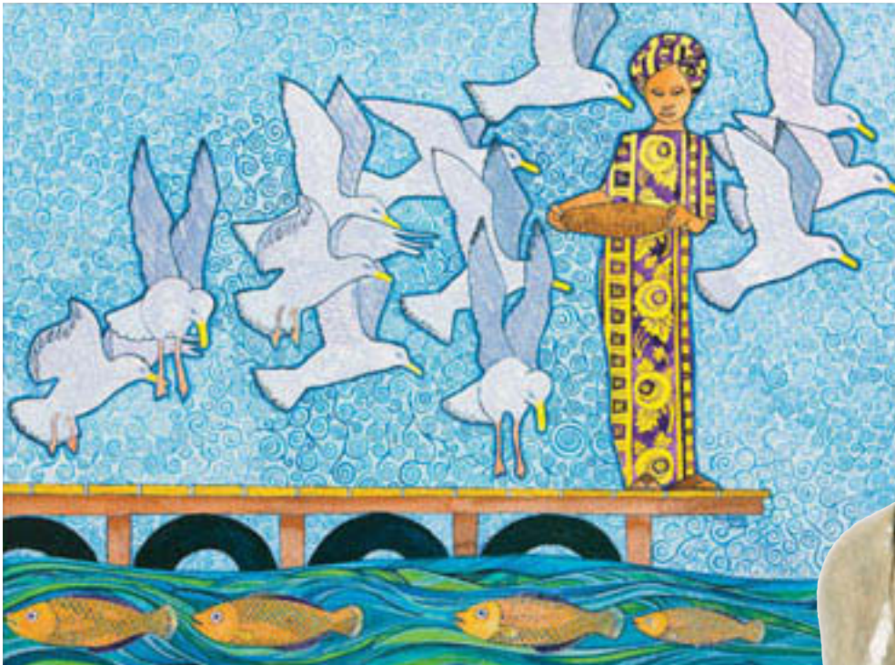
Above: Who Can Find a Virtuous Woman? II , by Louise Parker, South Africa, Purchase Award "I wanted to reflect the scripture [Proverbs 31] as well as celebrate the inherent characteristics of women in Africa. They are so industrious and generous and survive . . . with their dignity intact."