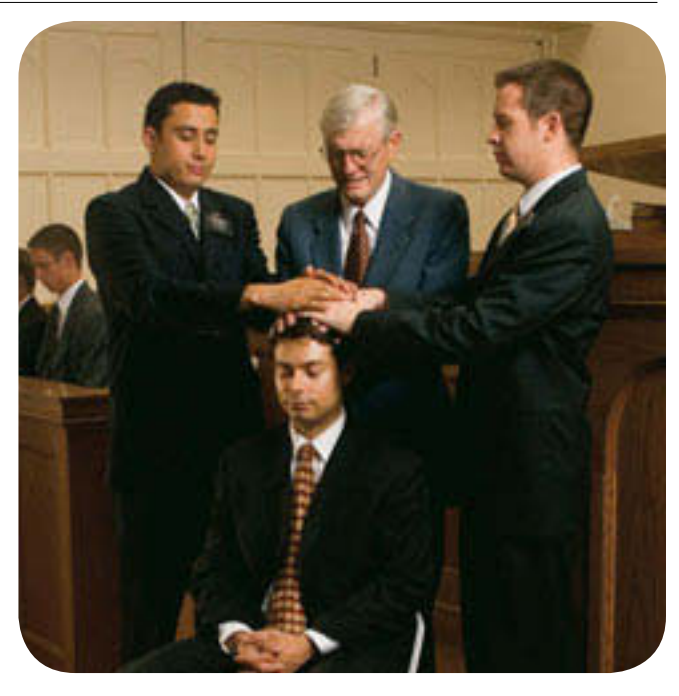
9. Through the power of the Holy Ghost, we become sanctified as we repent, are baptized and confirmed, and strive to obey God's commandments (see Mosiah 4:1–3; 5:1–6). ■

"The Holy Ghost shall be thy constant companion, and thy scepter an unchanging scepter of righteousness and truth; and thy dominion shall be an everlasting dominion, and without compulsory means it shall flow unto thee forever and ever" (D&C 121:45–46).