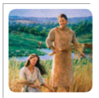
8. Adam was the first on earth to be baptized and receive the Holy Ghost (see Moses 6:64–66).